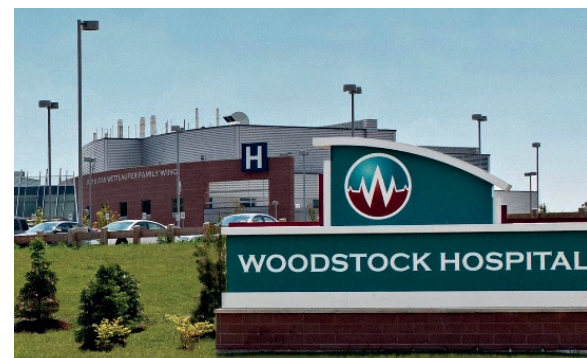
Photo of Woodstock General Hospital from their Facebook page.

Originally, the hospital in Woodstock, Canada, was heated by old gas boilers with a low efficiency. The hospital bought all their electrical energy from the power grid. Diesel generators provided backup power in the event of a grid supply failure. It was necessary to change this uneconomic model. The goal was to find a more efficient and environmentally friendly solution that would cover the year-round power consumption and make the hospital's heating more efficient. Thus, via cogeneration, it is ensured that the hospital is largely independent and by do so also saving the hospital on operational costs. It's efficiency is around 86%. The total financial return on the project is expected by approximately 5–6 years, all the while considering that the CHP unit's design supports a lifespan of 20 years or more.